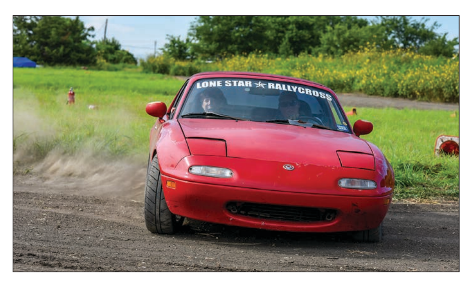
Brianne Corn is both a race car driver and a driving teacher, helping others learn in a controlled environment how to handle dangers like skids and swerves.

One at a time, cars weave through cones set up on the track for time. To race at the track, a car must be in good working order. It can't be taller than it is wide. Other than that, she said, "there are no rules, just