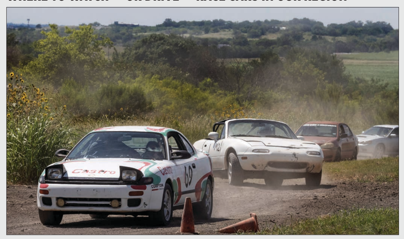
Rodolfo Gonzalez photo