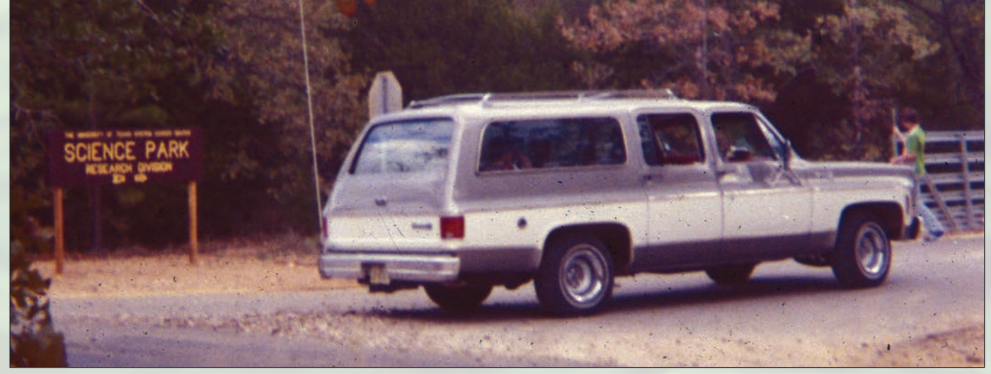
Sign of the times: A photo from 1977 at the Science Park entrance. At that time, only four buildings had been completed.